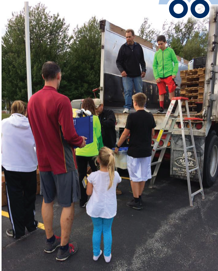
"Filling the Truck" in Perry, Ohio.